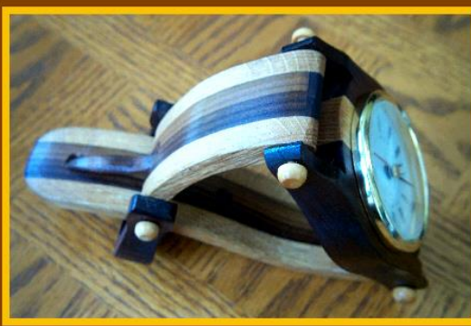
WNS-CLK-126 – Hand-Made Wooden Wristwatch Clock – Full Left Side View