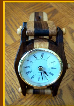
WNS-CLK-126 – Hand-Made Wooden Wristwatch Clock – Full Front View

Hand Made Wooden Wristwatch Clock (circa 1990s) - Made in Ohio by an Amish Woodworker.