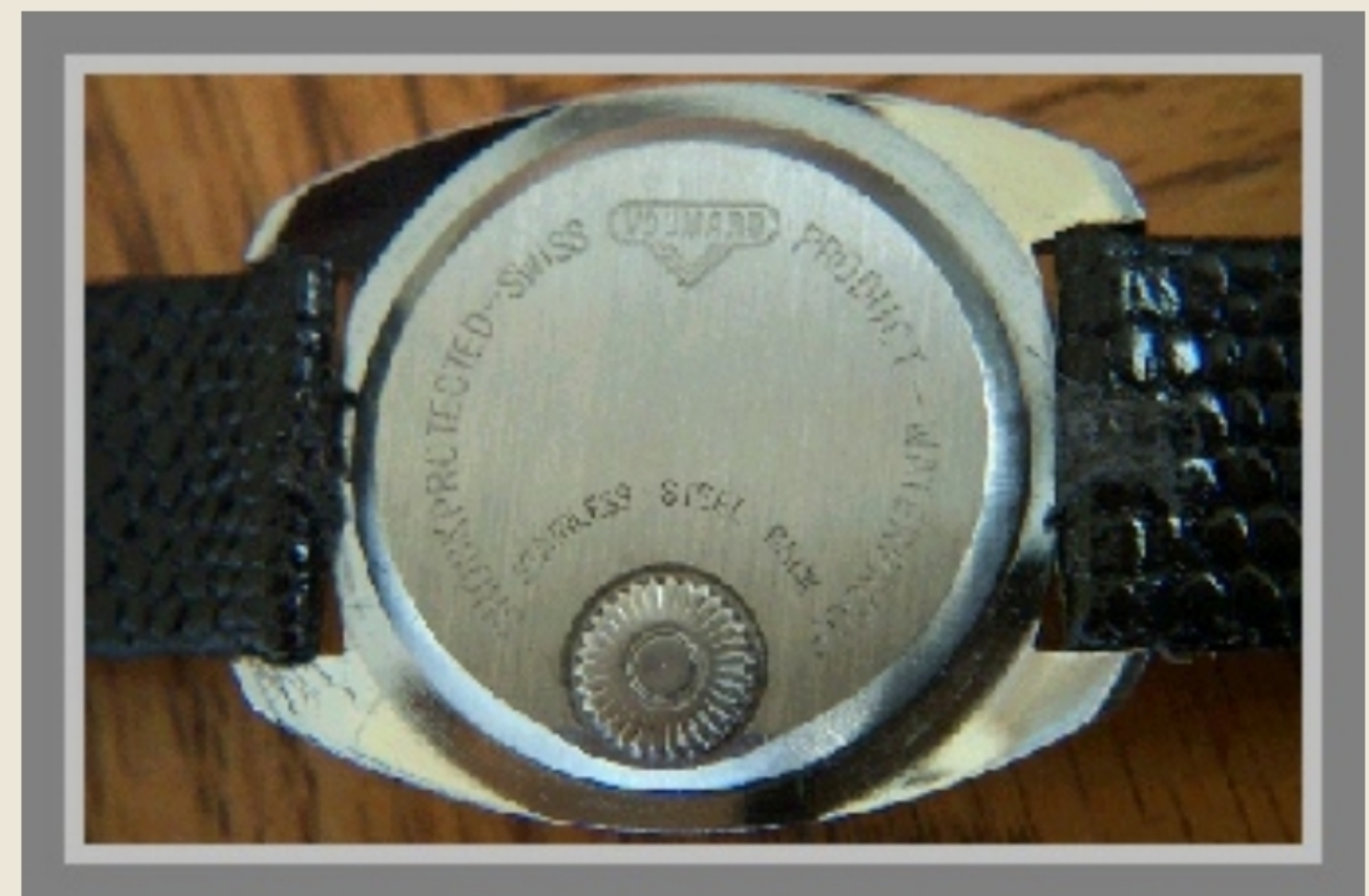
WNS-6070-4088 - Voumard - Crown on Rear of Case - Model 2000 - Rear Case View

Case: 32 mm across by 38 mm lug to lug - Highly polished chrome case with a Stainless Steel back - The crown is located in the rear case. The case back reads "Stainless Steel Back, Waterproof, Shockprotected, Voumard, Swiss Product".