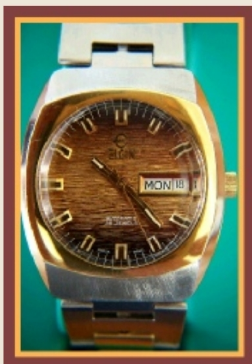
WNS-6070-4072 - Elgin - Wood Dial - Day-Date - Full Front View