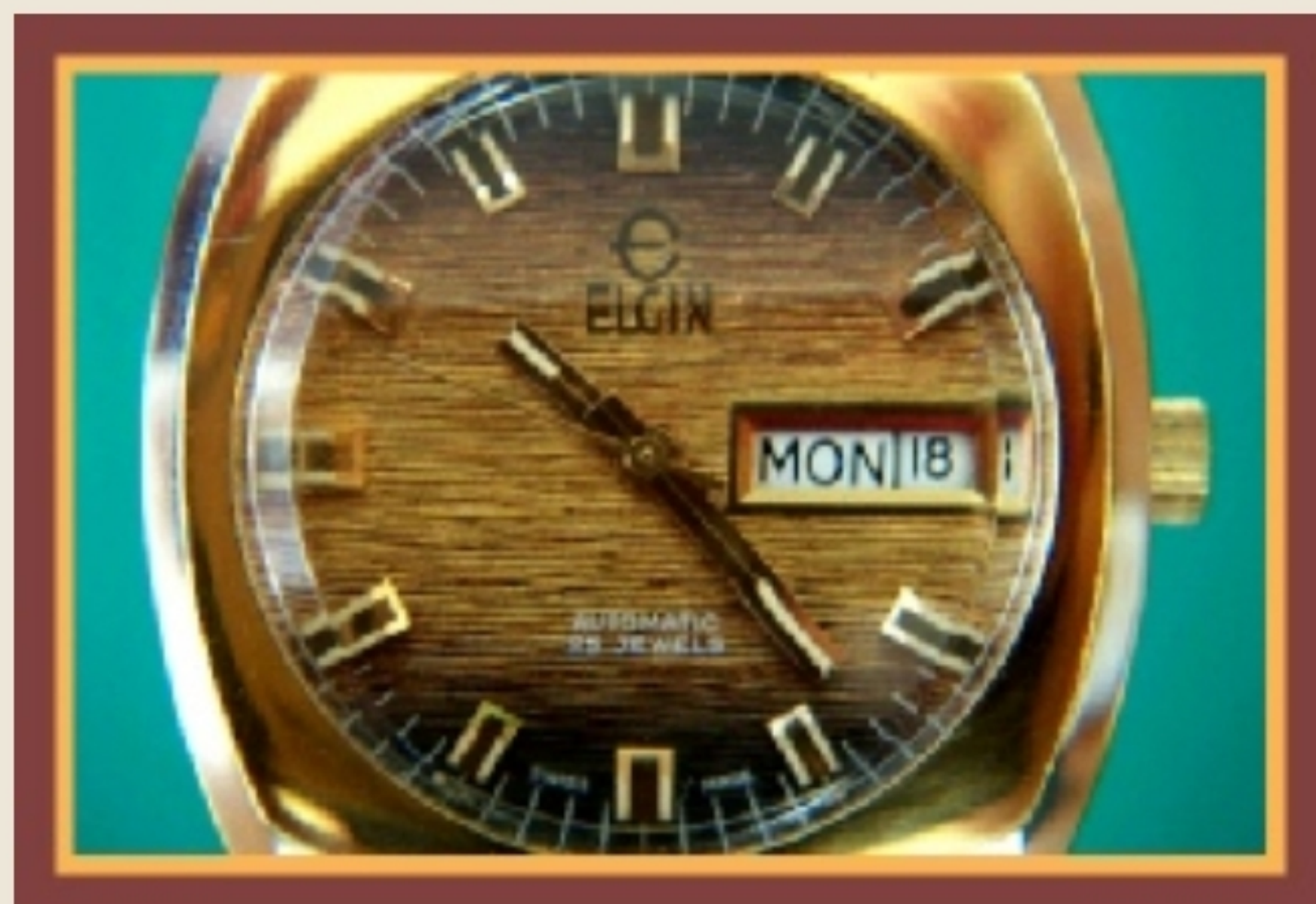
WNS-6070-4072 - Elgin - Wood Dial - Day-Date - Dial Close Up View