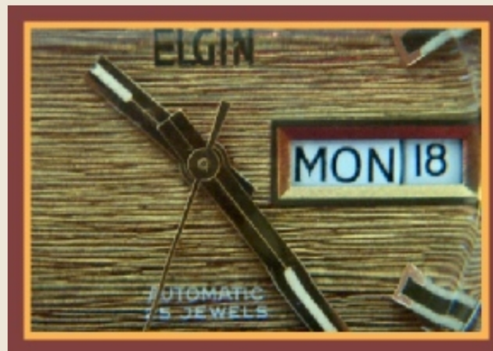
WNS-6070-4072 - Elgin - Wood Dial - Day-Date - Center Dial Close Up View