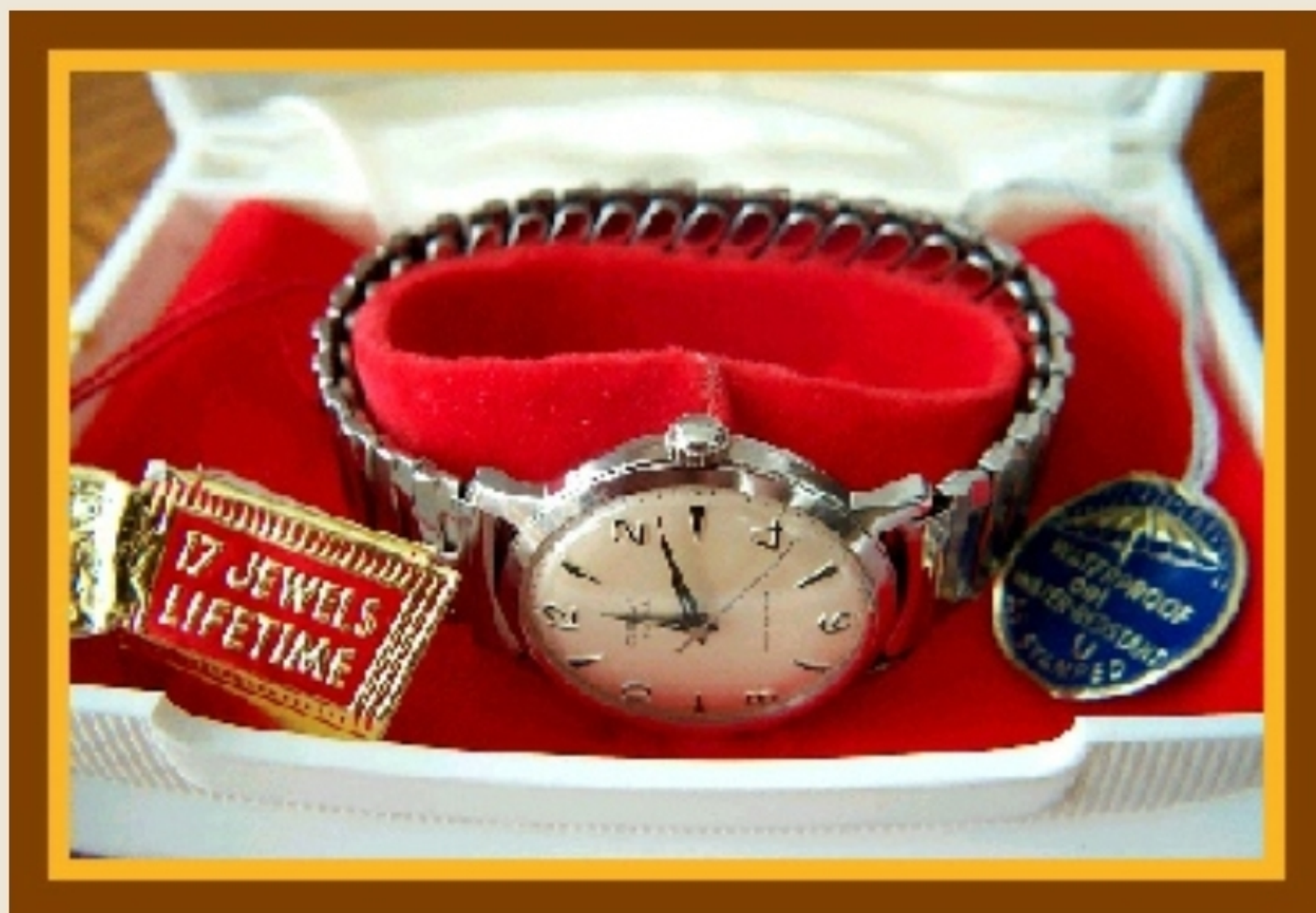
WNS-6070-4083 - Clinton - 17 Jewels - All Stainless - NOS - Full View in Box