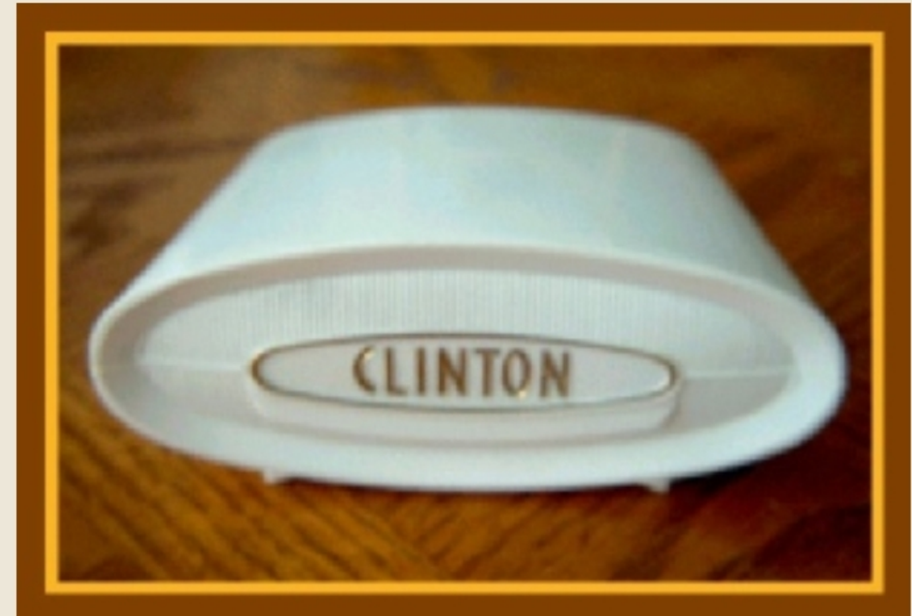
WNS-6070-4083 - Clinton - 17 Jewels - All Stainless - NOS - Outer Box View