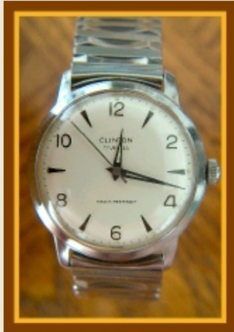
WNS-6070-4083 - Clinton - 17 Jewels - All Stainless - NOS - Full Front View