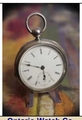
WNS-PW-6070 - Ontario Watch Co. - 18 size - Open Face Silver Coin Case - ca. 1870 - Inside of Back Case Markings View