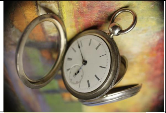
WNS-PW-6070 - Ontario Watch Co. - 18 size - Open Face Silver Coin Case - ca. 1870 - Full Open Case View