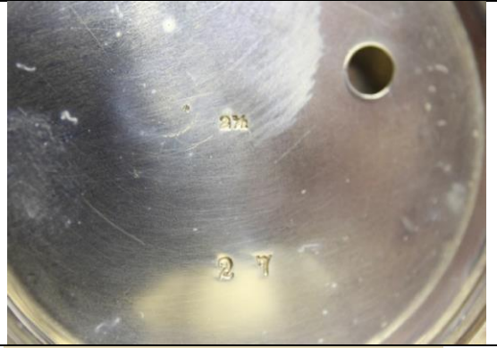
WNS-PW-6070 - Ontario Watch Co. - 18 size - Open Face Silver Coin Case - ca. 1870 - Dust Cover Markings View