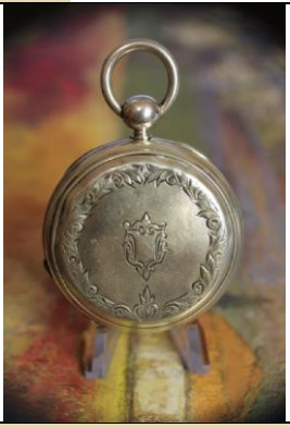
WNS-PW-6070 - Ontario Watch Co. - 18 size - Open Face Silver Coin Case - ca. 1870 - Full Back View