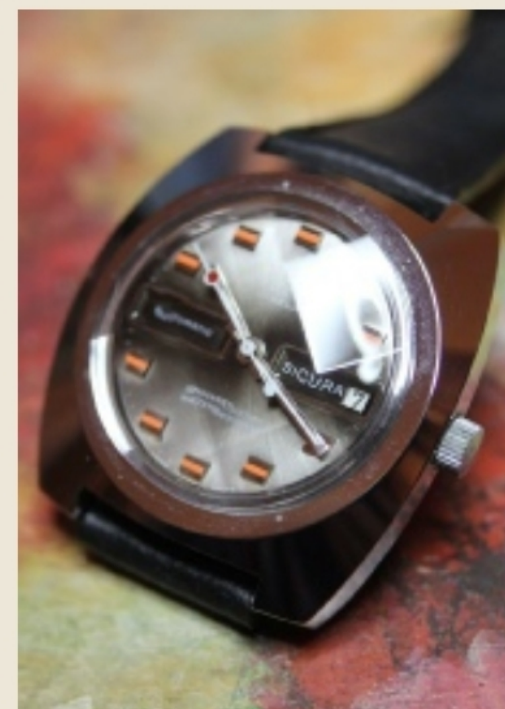
WNS-6070-4065 - Sicura - NOS - Silver-Orange Dial - Full Right Front View

Case: 36 mm diameter – 40 mm lug-to-lug - Two-Piece Case - Crown at the 3 o'clock position. The back case is marked Swiss Made, Stainless Steel Back, Base Metal Bezel, Water Resistant and the Sicura Seahorse and Crown symbol.