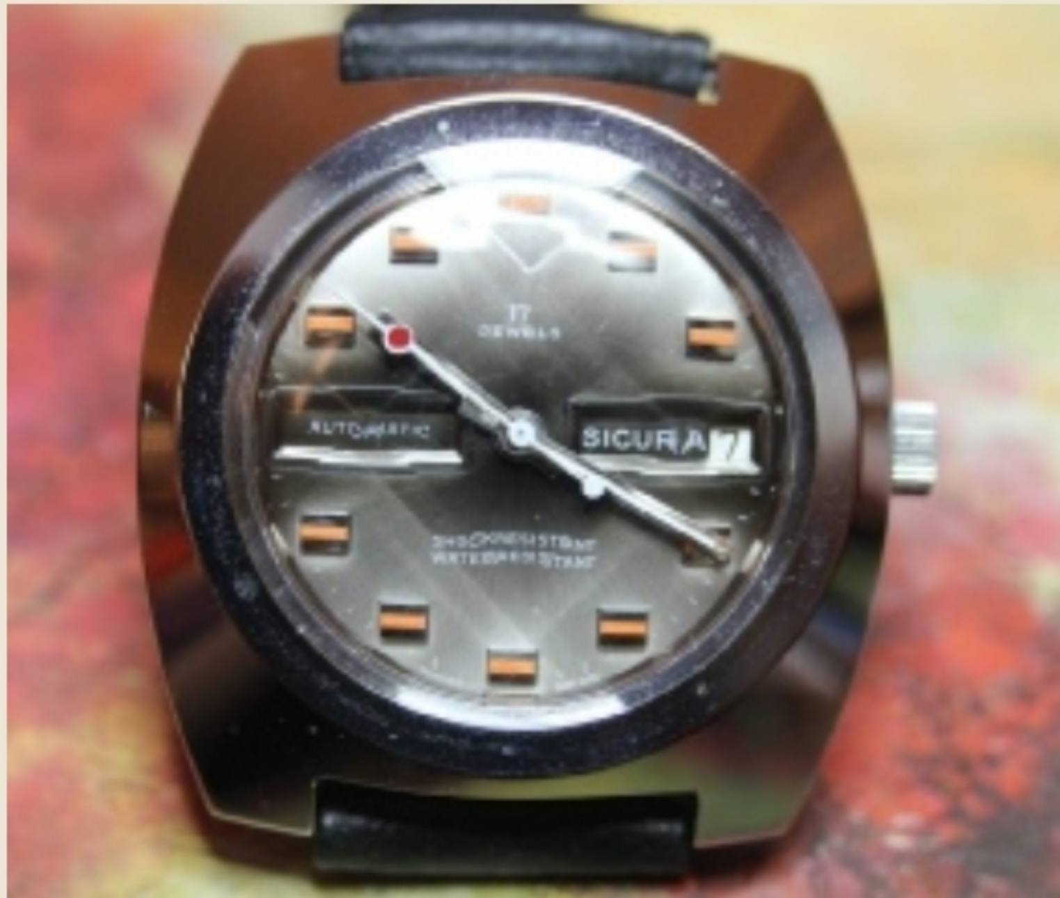
WNS-6070-4065 - Sicura - NOS - Silver-Orange Dial - Dial Close Up View