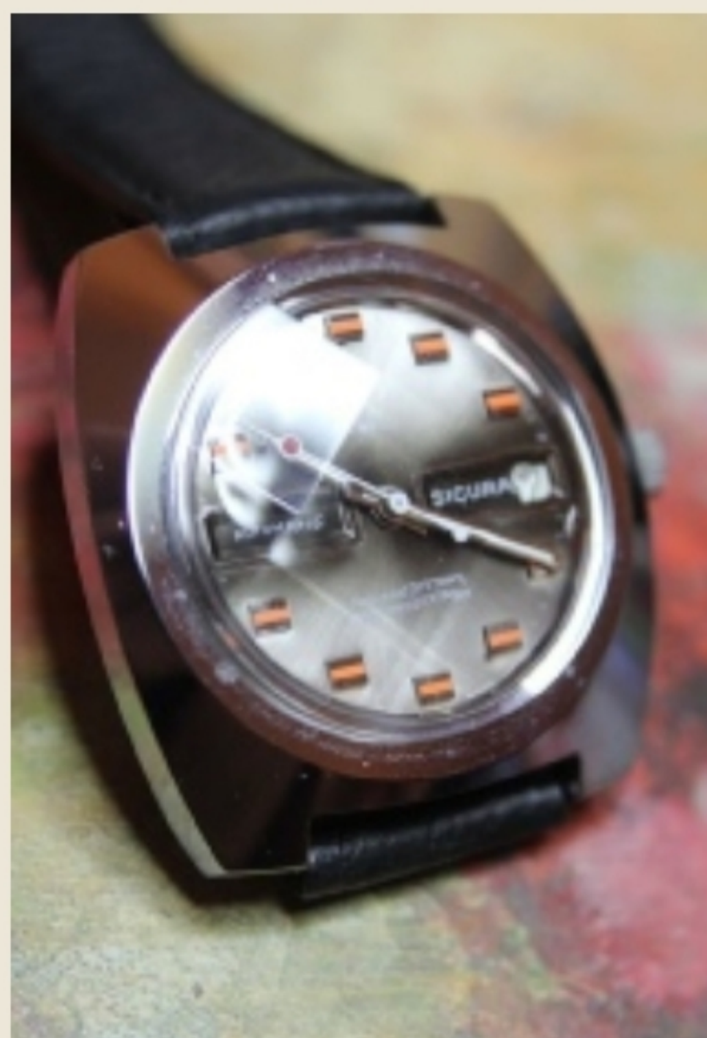
WNS-6070-4065 - Sicura - NOS - Silver-Orange Dial - Full Left Front View