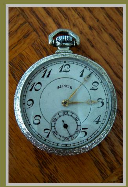
WNS-PW-6021 - 1917_Illinois_Fancy_16size_PW_- Front View