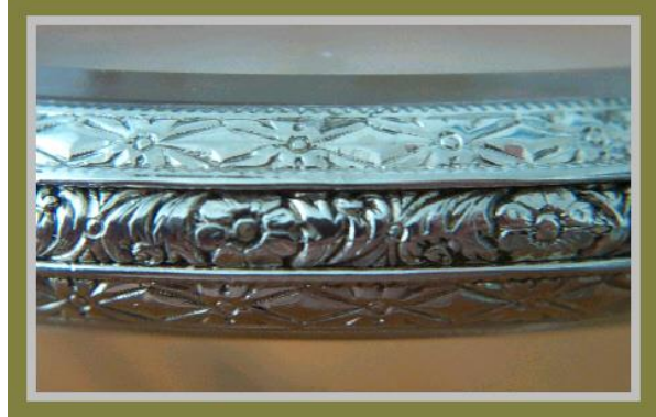
WNS-PW-6021 - 1917_Illinois_Fancy_16size_PW_- Side of Case Engravings