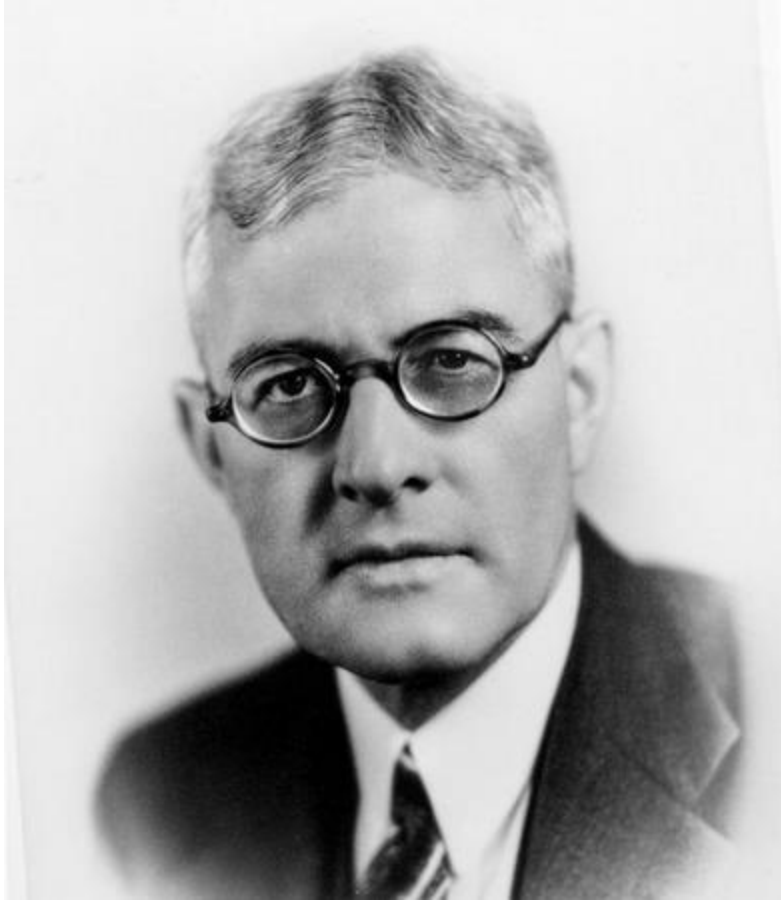
Daytona Beach Mayor Edward Armstrong