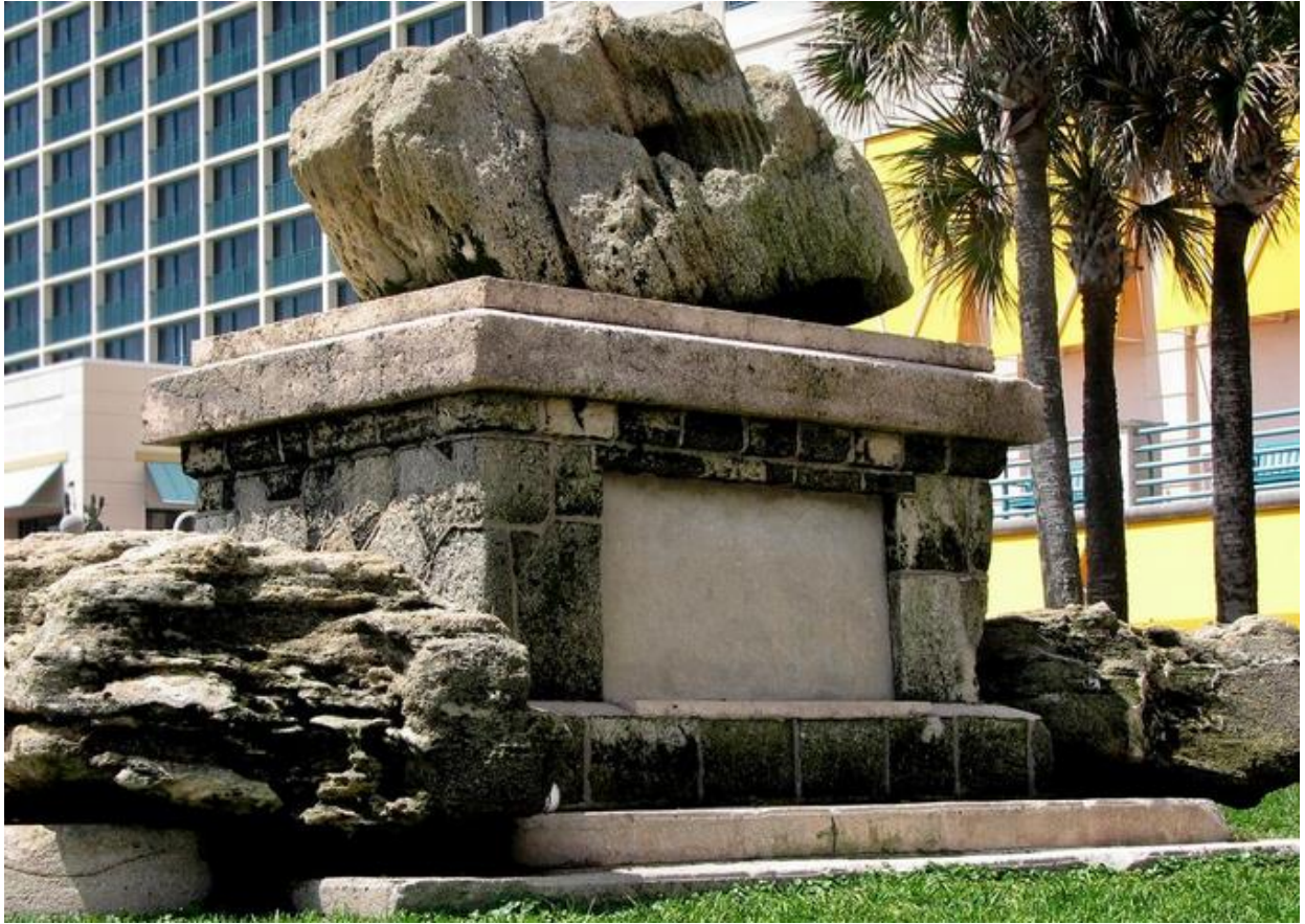
The blank monument where some want Armstrong's plaque to go.